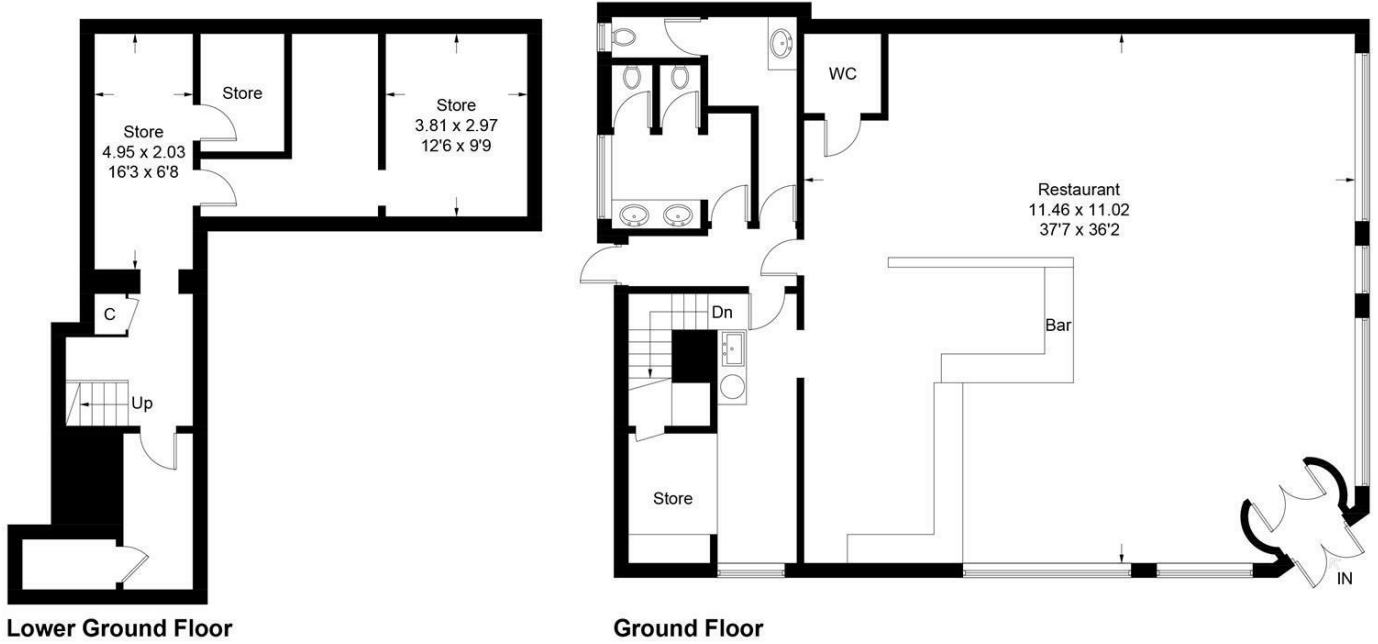
Illustration for identification purposes only, measurements are approximate, not to scale. Fourlabs.co © (ID1229779)

Approximate Gross Internal Area = 219.5 sq m / 2363 sq ft